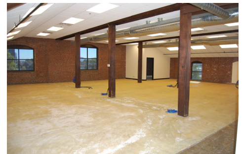
Suite 400 open area ready to accept Tenant finishes