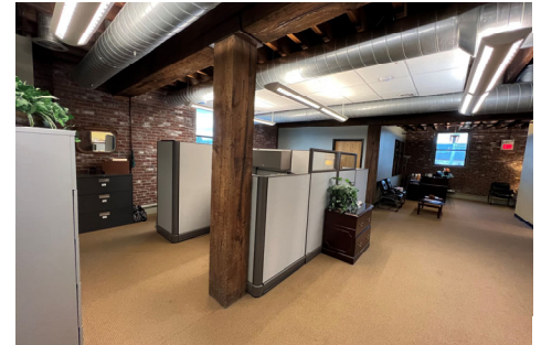
Open work area