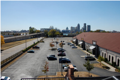
View from 4th floor looking towards Downtown Louisville and YUM Center

300 Missouri Avenue in the Water Tower Square Business Park