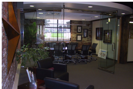
Tenant conference room